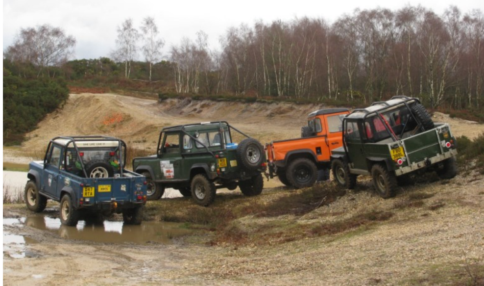
Members take a break at the Mannington RTV