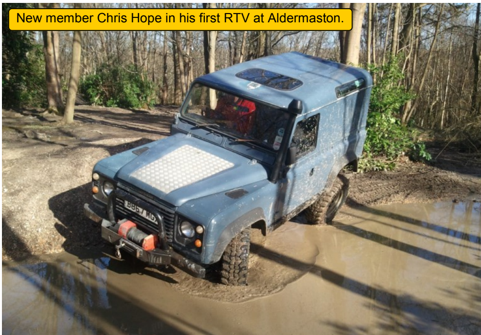
Pete Kendall tackles a big old drop at the Aldermaston RTV.