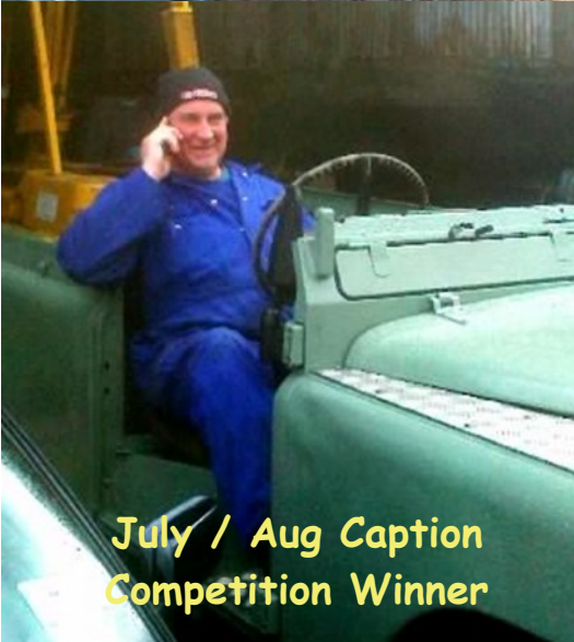
July / Aug Caption Competition Winner

Last months caption competition was won by another one of our USA members Pam Dawber (who played Mindy McConnell in the 1980's smash sit com 'Mork & Mindy'). Pam is convinced that this is an actual still from an episode called "Dodgy Bodgy" and that the person shown is her alien flat mate Mork on the telephone to 'Orson' and saying "This week Orson I have discovered a easy way to make money. It's by buying and selling these strange vehicles called Land Rovers to an even stranger group of people who are not afraid to come out into the open and say they like them"