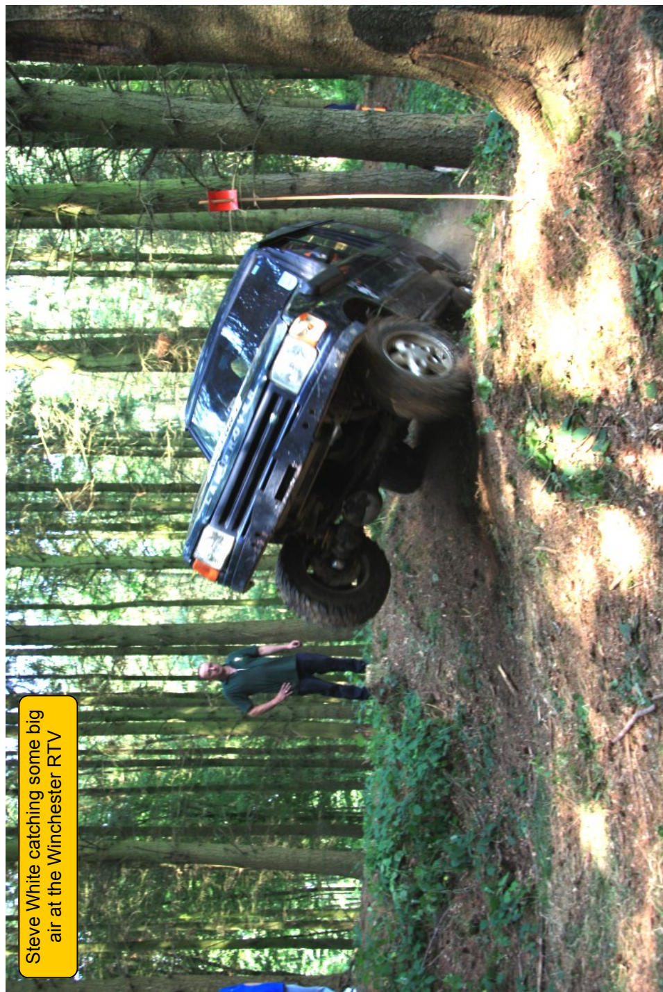
Steve White catching some big air at the Winchester RTV